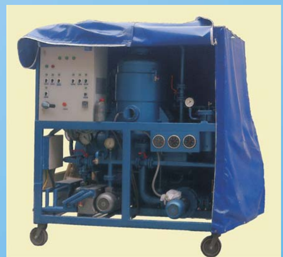
S-3000 / 6000